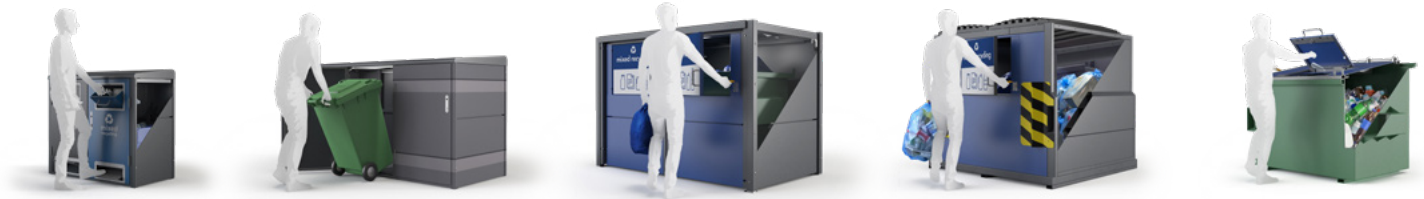
metroSTOR RCF System Street Deposit Enclosure

FX is the product in the range most directly optimized for organics and other contamination-sensitive streams. For more general cart and bagged waste or recycling, see metroSTOR RC System . For direct public deposit environments, see metroSTOR RCF System . For higher-volume applications, see metroSTOR BD System and metroSTOR metroPOD System .