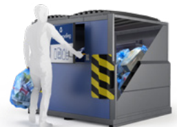
metroPOD System Controlled-Deposit FEL Dumpster