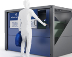
BD System Dumpster Enclosure