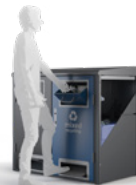
RCF System Street Deposit Enclosure