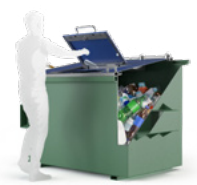
metroLID System Retrofit Controlled-Deposit Lid