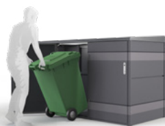
RC System Cart & Bag Enclosure