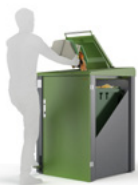
FX System Controlled-Deposit Organics Enclosure

metroPOD is the high-capacity controlled-deposit FEL product in the metroSTOR range. For dumpster enclosure around existing wheeled dumpsters, see BD . For cart-scale and bagged shared-use formats, see RC and RCF . For contamination-sensitive organics capture, see FX . For retrofit control of existing dumpsters, see metroLID .